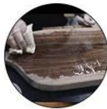
7 Painting and Coating