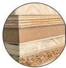
2 Material Selection